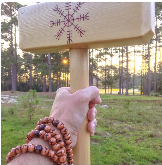
Hail those who show up {\mathscr B} Hail Ódinn {\mathscr B}