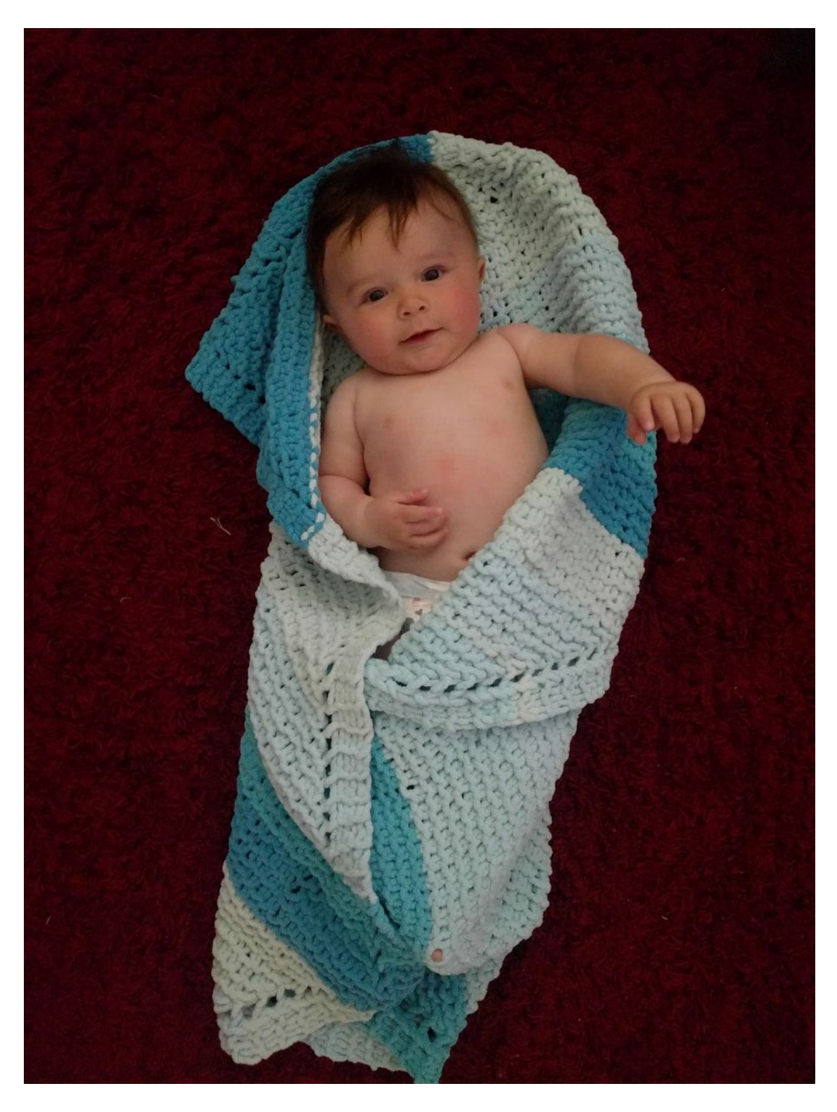
The Women of the AFA are proud to be continuing this fine and noble work we call the Baby Blanket Project! We're committed to ensuring all new babies born within the AFA are gifted a hand made - knit, crocheted, or woven - baby blanket! It's just our

or volunteer as a baby blanket crafter, let your folk builder know about that as well, too, and he'll get you in touch with the right people. It's so rewarding to see your handicraft being loved by our little heathens!